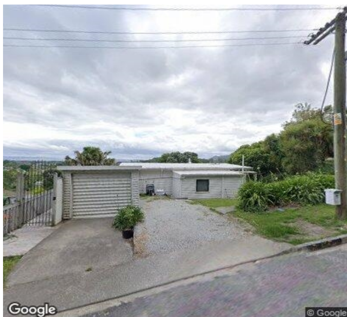
Google Streetview Image